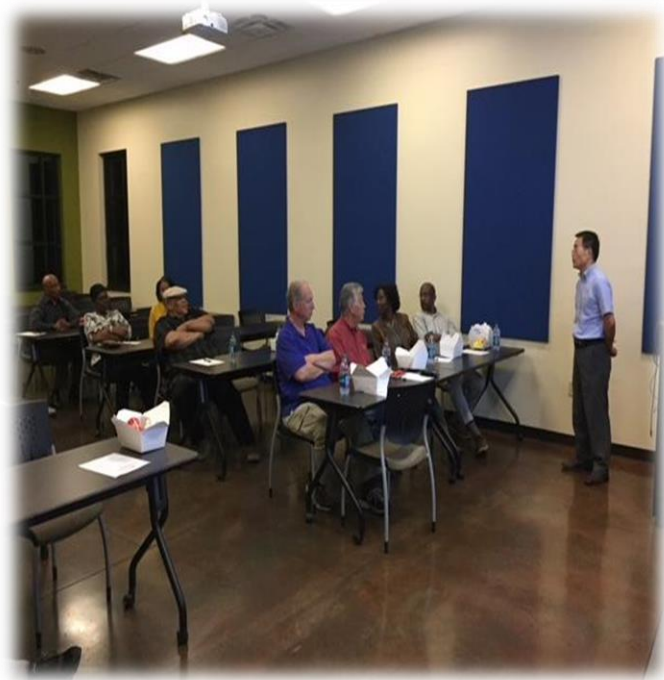
2018 Prostate Cancer Awareness Month Celebration with Victory Church